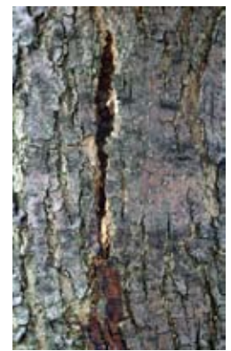
Vertical splits in bark

Thin, relatively short (2-5 inches long) vertical splits through the bark of living trees (with galleries beneath).