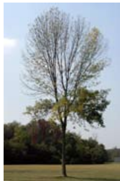
Thinning canopy and top dieback