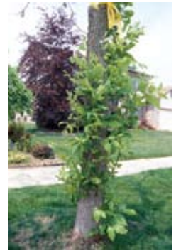
Epicormic basal shoots