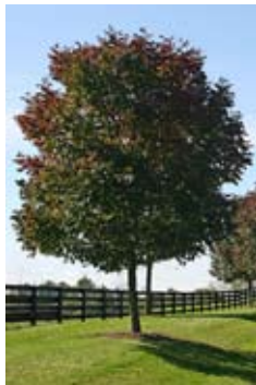
Healthy ash tree