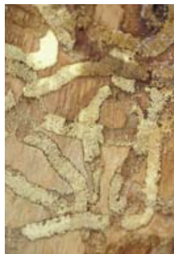
Galleries filled with frass

Galleries are tightly packed with fine frass (a mix of sawdust and excrement). They do not extend into the sapwood, as do those produced by the common native clearwing or roundheaded borers that infest ash.